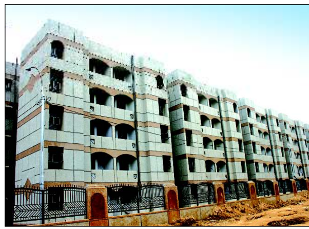
LIG Flats at Rohini

1. C/o 100m R/W GTK Road to Western Yamuna Canal.