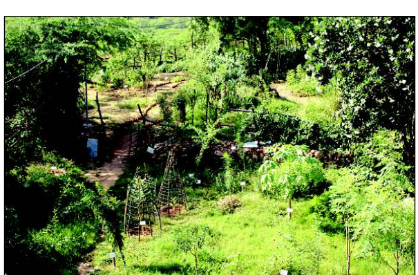
Herbal Garden at Aravali Biodiversity Park