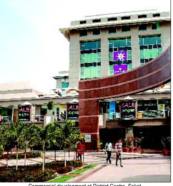
Commercial development at District Centre, Saket