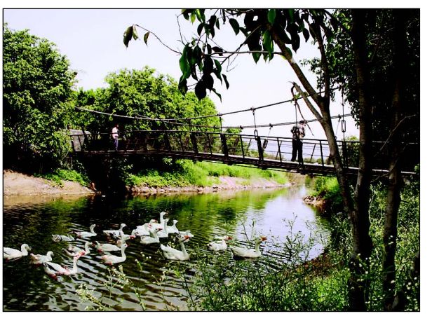
A view of suspension bridge at Swarn Jayanti Park, Rohini

DDA has promoted the development of green belts, theme parks, urban-woodlands, green areas around monuments, Bio-diversity parks etc. which are being designed in house by the Landscape Unit of DDA.