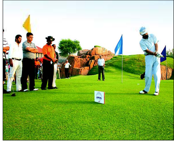
Golf Tournament in progress at Qutab Golf Course

Qutab Golf Course at Lado Sarai, the first Public Golf Course, has gained immense popularity with around 300 rounds being played during weekends in peak season which in itself is a record for any course.