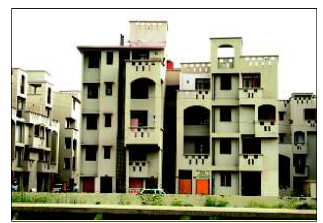
MIG Flats at Vasant Kunj

The landscape plan for Mega Housing was prepared on the basis of existing Master-Plan and location of built blocks on site. Proceeding from the given restraints on site, the latest requirements, fire tender access, etc were incorporated, and layout was designed to provide identity to each cluster and common areas.