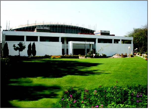
Badminton Stadium under construction for CWG-2010 at Siri Fort Sports Complex

These works are targeted to be completed by March, 2010 and targeted to be handed over to Organising Committee on 01.04.2010.