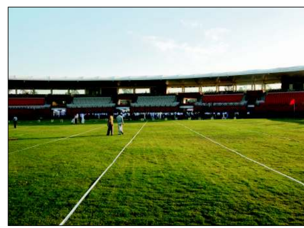
Venue for Archery at Yamuna Sports Complex