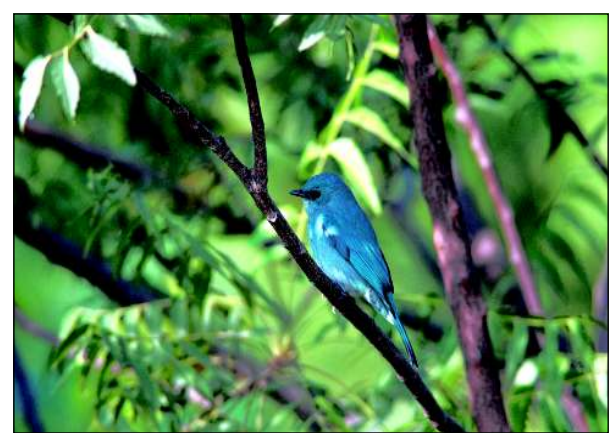
Vertider Flycatcher perching on a Neem Tree at Aravali Biodiversity Park

Unauthorized Colonies falling in Zones P-I and P-II causing physical hindrances have been submitted as per public notifications.