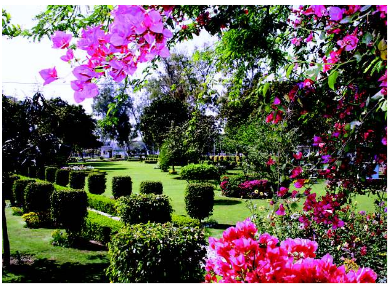
Green developed at Rashtriya Swabhiman Khel Parisar, Pitampura