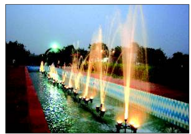
A night view of fountain at Swarn Jayanti Park, Rohini