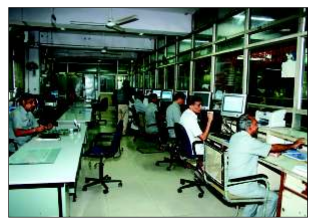
Inside view of Receipt and Dispatch Counters at Reception, Vikas Sadar

File tracking software is operational in the Vigilance Department of DDA.