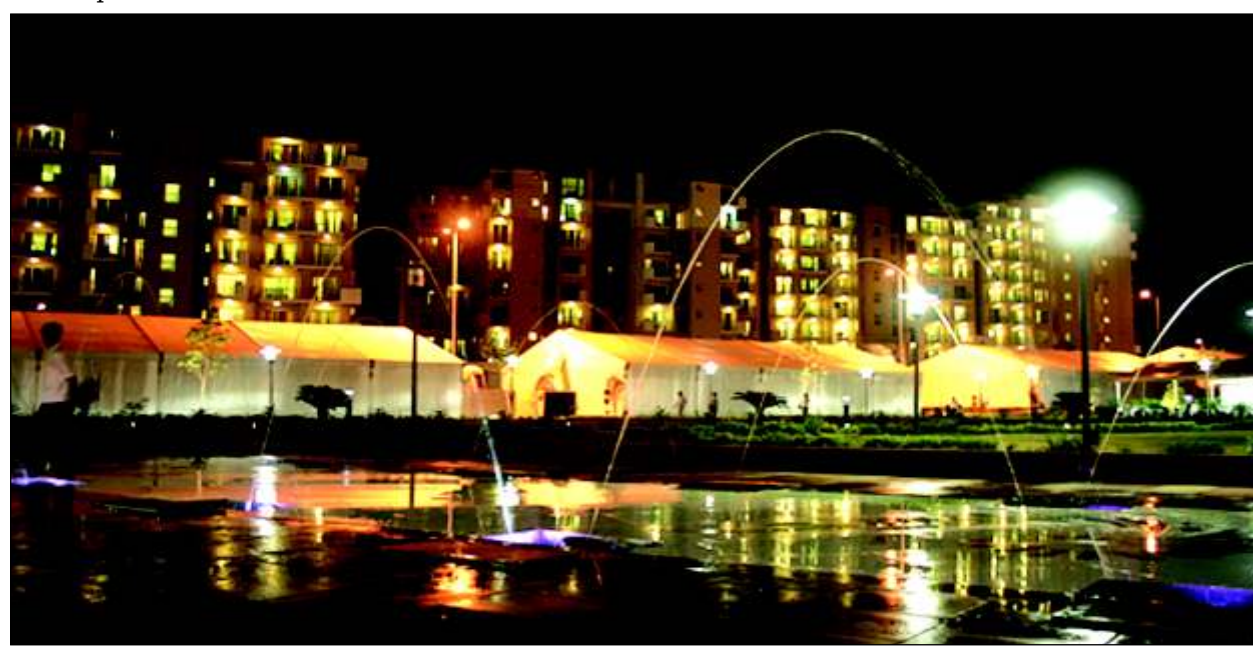
A view of residential zone at Games Village

Constructed on Public Private Partnership (PPP) mode on a plot of 11 hectares to accommodate 8000 athletes & officials. There are 34 towers comprising 1168