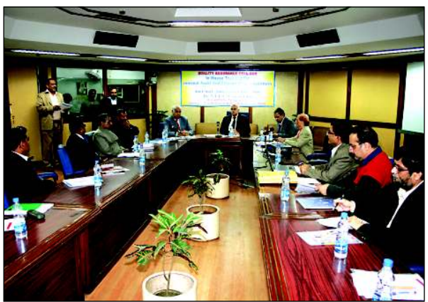
A view of training session of Internal Audit and Change over/Awareness for Quality Assurance Cell engineers