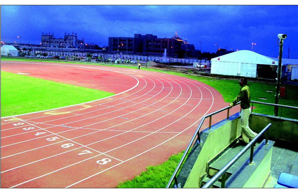
Athletics track for practice at Games Village

Taking an overall view of the mammoth task undertaken by DDA in construction of the Games Village, the Competition venues and the Training venues and the work which has been taken up by the DDA team can well be appreciated. As all the work was almost completed by the end of the year under report.