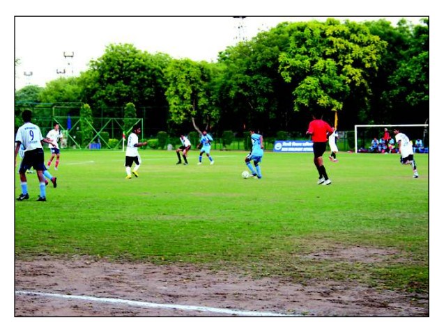
A match in progress in F M Soccer Cup Tournament at Siri Fort Sports Complex

Open selection trials for admission to DDA Football Promotion Scheme were held at SFSC and CSC on 18th - 19th July 2009 and 25th - 26th July, 2009 respectively. 75 boys are presently undergoing training; 45 at SFSC and 30 at CSC.