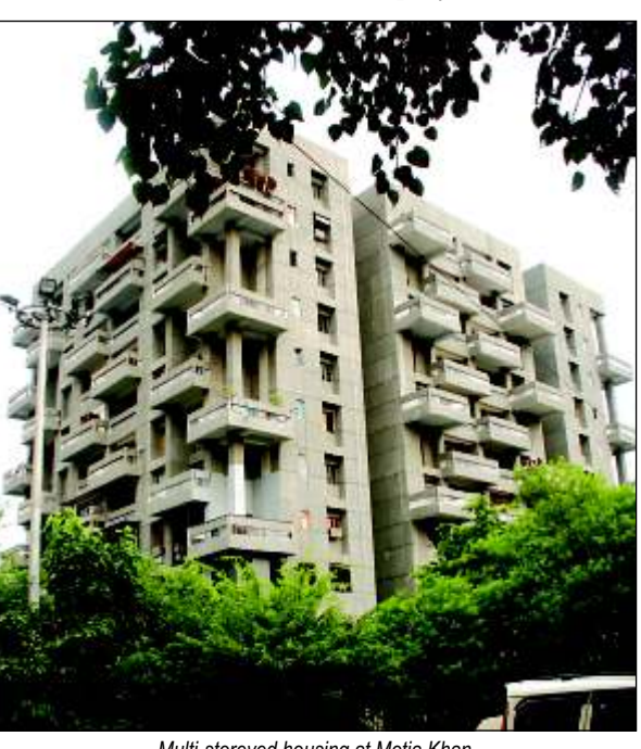
Multi-storeyed housing at Motia Khan

Out of 3335 approximately 3205 possession letters have been issued till 31.03.2010 (Flats offered in Narela, Dwarka, Rohini and Bindapur).