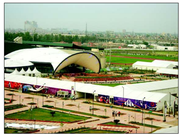
Temporary structures at Games Village