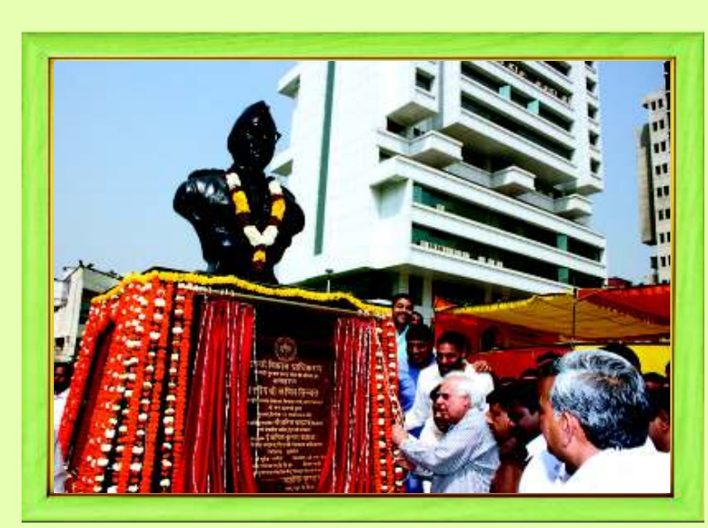
Sh. Kapil Sibal, Union Minister of Human Resourses unveiling the statue of Netaji Subhas Chandra Bose at Netaji Subhas Place