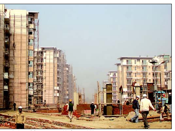
A view of Commonwealth Games Village - construction in progress

The prime objective of the development of the non residential facilities along-with Commonwealth Games Village is to provide a world class games village for 2010 Commonwealth Games to be held in Delhi and leave the legacy that provides a first class sports precinct for the citizens of Delhi. The entire site has been divided into zones namely: Residential, International/ Transport Mall, Welcome Plaza, Training Centre, and Parking. The large Welcome Plaza with amphitheatre, stately boulevard lined with large tree canopies is