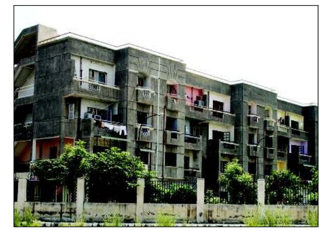
MIG Housing at Dwarka