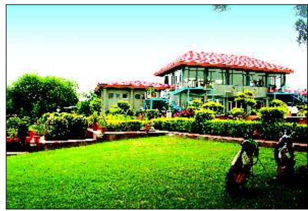
A view of Qutab Golf Course

Up-gradation of Sports infrastructure and associated ambience has been accorded adequate priority so that the members get to use the state of art facilities and environment free of pollution. The attention has also been on smooth membership management and customer satisfaction.