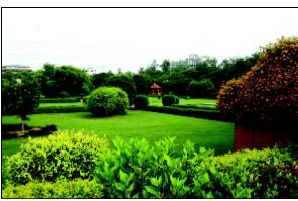
A view of Chitragupt Park