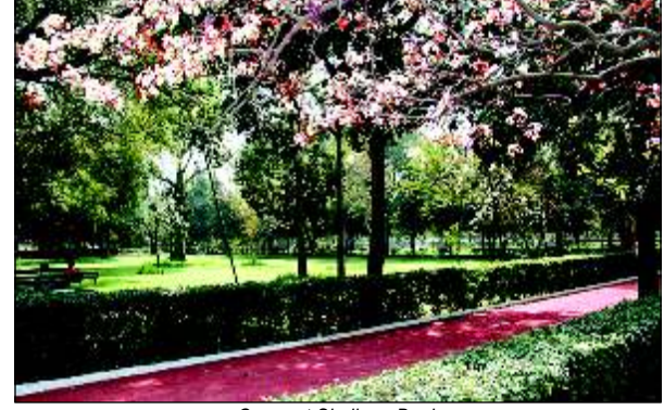
Green at Shalimar Bagh