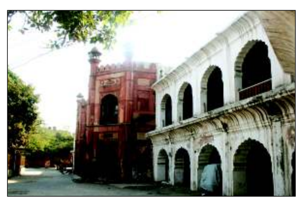
Anglo-Arabic Sr. Secondary School, Ajmeri Gate

The first Master Plan of Delhi was formed in 1962 with perspective upto 1982. A significantly improved Plan was formed in 1990, this time with a perspective upto the year 2001. In the new millennium, DDA set its goals afresh with Master Plan Delhi - 2021. Master Plan 2021 envisages making Delhi a global metropolis and a world class city, where all would lead a better