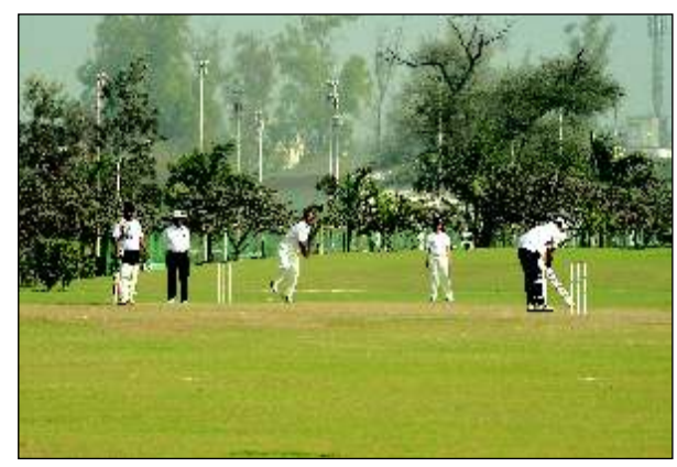
A match in progress in VC's Cricket Cup Tournament at Siri Fort Sports Complex

The Sports Wing DDA having launched the games, sports and health awareness programmes in Delhi through its Sports Complexes, Multygyms, Swimming Pools and Golf Courses has been successful to a great extent in supporting the Sporting Vision of the DDA. Citizens of Delhi have now the opportunity of taking up sports and games of their choice by adopting to pay and play concept started by DDA, be it a Sports Complex or a Golf Course.