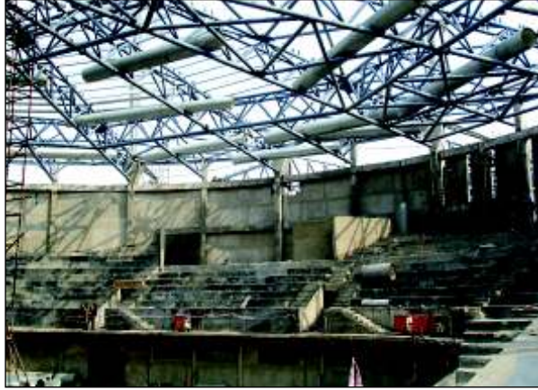
Indoor Stadium under construction for CWG-2010 at Yamuna Sports Complex

DDA has been taking up a number of special projects as a part of its development programme and for providing facilities at city level. During the year 2009 - 10, DDA completed/ started following special/ major projects.