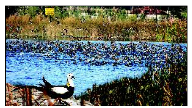
Pheasant tailed Jacana in marshes of Yamuna Biodiversity Park