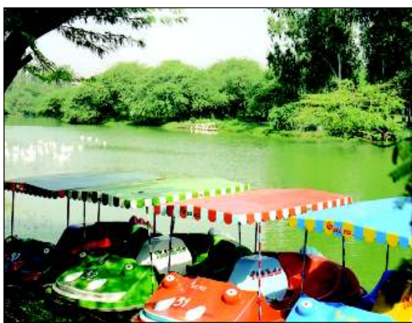
A View of Sanjay Lake at Trilokpuri

The green area, approx 52 acres was earlier under CPWD, and as per directions of Hon'ble LG, the area has now been handed over to DDA. Now INTACH has been appointed as consultant for this project. At the site of the 1911 Coronation Durbar, a memorial was erected, and in the post independence period it was planned to bring all British period statues from all over the country and display these in the open at this site. However, though several pedestal for statues were erected only five statues and two busts were eventually brought here. Owing to the limited number of statues, lack of appropriate facilities, constant water logging, inappropriate developments in its surroundings and limited maintenance, the park has never attracted enough visitors. The Coronation Park together with Memorial, is capable of becoming a major tourist attraction in Delhi, especially for foreign visitors. To achieve this, steps need to be taken on several fronts.