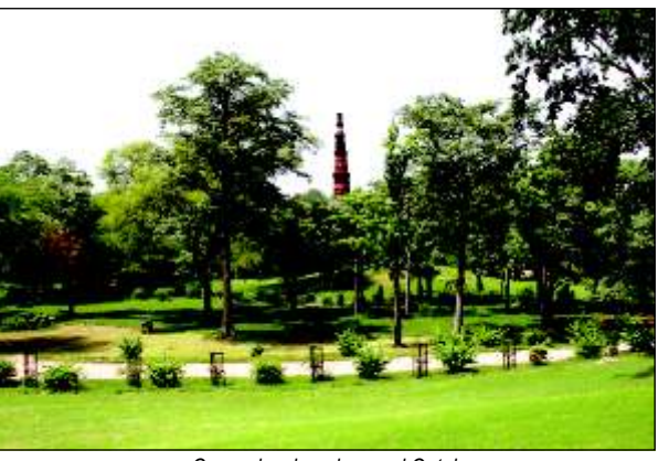
Green developed around Qutab

As regards recovery of ground rent about 8200 defaulter notices were issued against the defaulting allottees, as a result of which, it has been possible to recover Ground Rent to the tune of Rs. 63.89 Crore as against the corresponding period recovery of Rs. 62.13 Crore. Similarly license fee amounting to Rs.55.15 Crore has been recovered during this year.