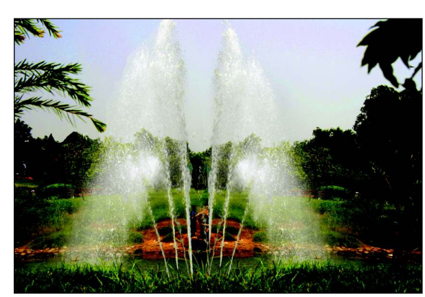
A fountain in the middle of Lake at Swarn Jayanti Park, Rohini

Special drive for conducting the Internal Audit of Pay Fixation consequent upon the implementation of 6th Central Pay Commission was carried out in the first quarter w.e.f. 01.04.2009 to 30.06.2009.