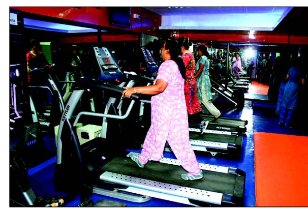
A view of Gymnasium at Vikas Sadan

Computers are available at all the Sports Complexes and Golf Courses and computerized billing/ notices are being dispatched on a regular basis. Back-log of defaulters is being cleared and membership of those who continue to be in the defaulters list is being cancelled on a regular basis.