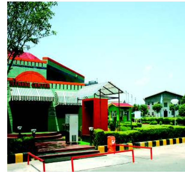
Dwarka Sports Complex

The daily average utilization of the sports facilities is approx. 14000 individuals. Beside facilities are utilized by schools/ colleges/ institutions etc for training or organizing sports events.