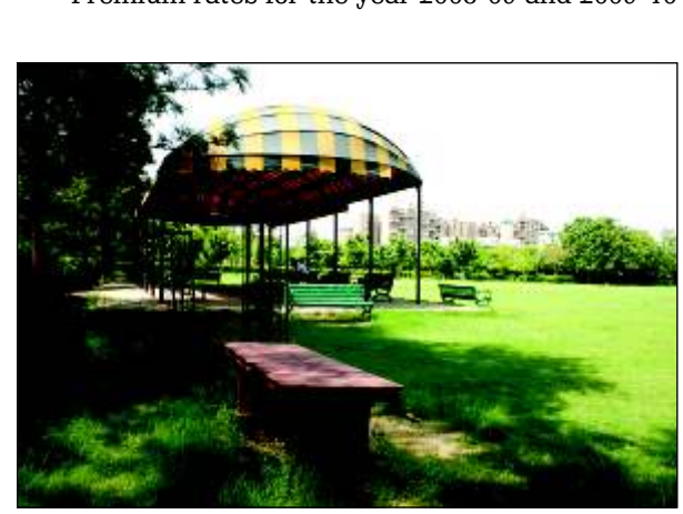
A view of Park at Dwarka

The Agenda for fixation of Institutional Land Premium rates for the year 2008-09 and 2009-10