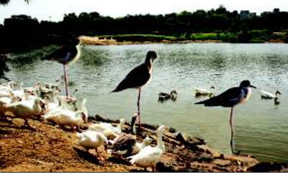
A View of Lake at Swarn Jayanti Park, Rohin.