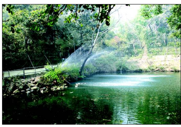
A view of Northen Ridge