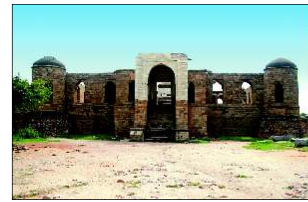
Sultan Garhi monument - one of the conservation projects undertaken by DUH

Master Plan Delhi - 2021 also takes into account the needs for the Commonwealth Games in 2010 to be held in Delhi. Accordingly, DDA has not only given a facelift to Delhi, but actually developed the infrastructure at par with international standards to host the international event.