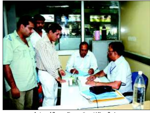
A view of Counselling section at Vikas Sadan