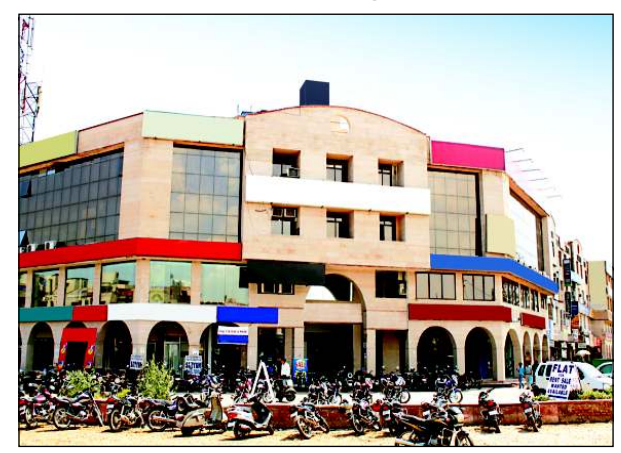
Commercial development at Dwarka